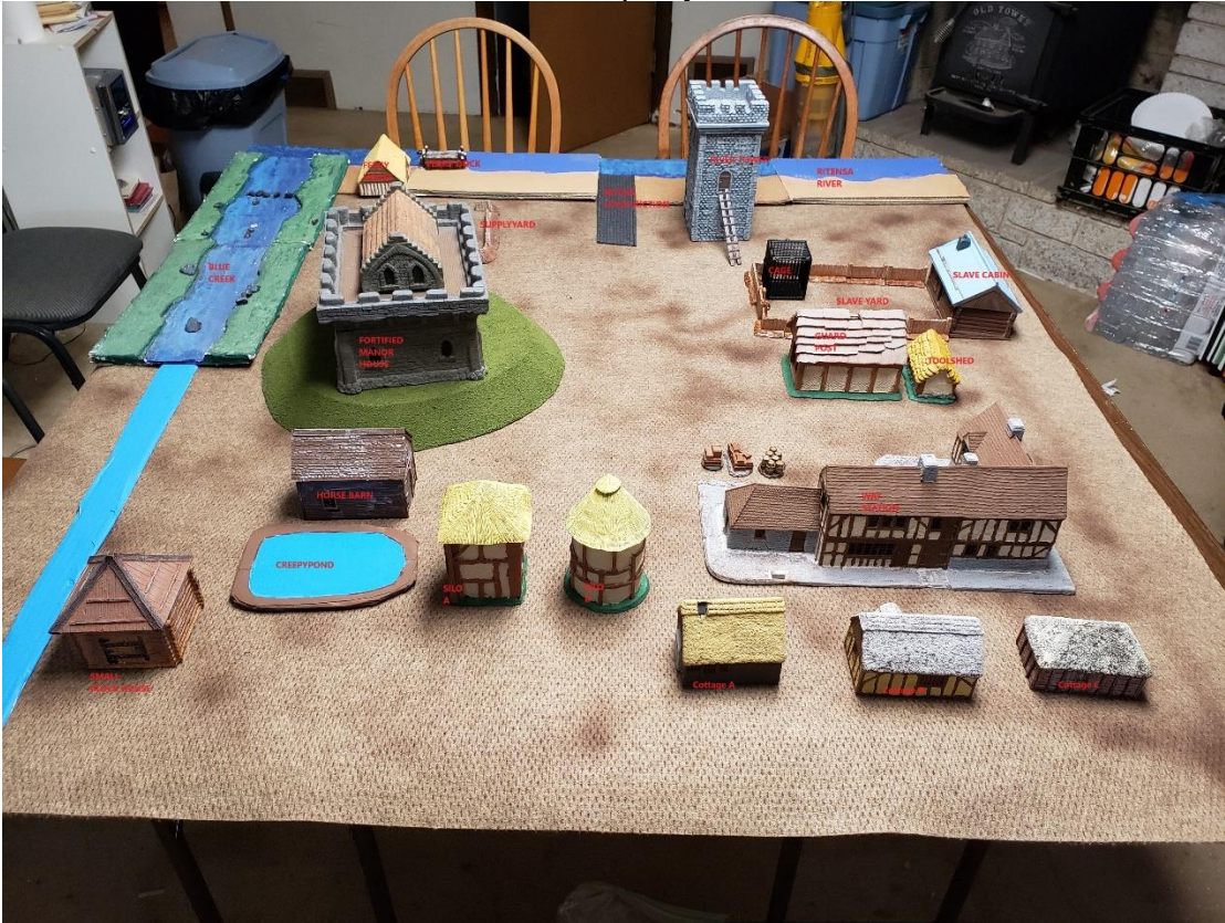
BLORGON FROM THE EAST

which Bunyon had said had been an ornamental fish pond, was surrounded by piles of bones, mostly goblins, but some bigger. He looks into the barn and spots 8 horses and 2 goblin stable hands. He is nearly spotted by a hoborg archer on the roof of the manor house, and so decides to withdraw back to the party.